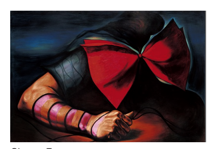
Okamoto Taro Wounded Arm 1936 / 1949 Oil on canvas 1118 × 1622 cm Collection: Taro Okamoto Museum of Art, Kawasaki

Here we explore the expression of a range of emotions that accompany the loss of love, including feelings of loss, regret, attachment, and consolation.