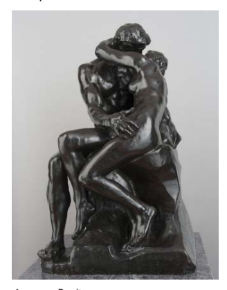
Auguste Rodin The Kiss c. 1882-87 (model) Bronze 87 \times 51 \times 55 cm Collection: The National Museum of Western Art,

Here we focus on romantic love, a theme important to people irrespective of region and culture, and consider the circumstances in which couples fall in love.