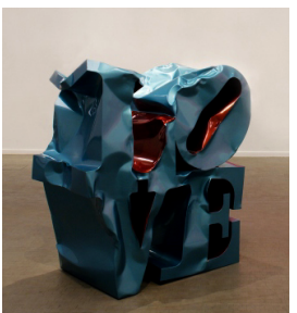
Gimhongsok 2005 Stainless steel, car paint 205 × 85 × 200 cm

Here we flesh out the image of love through symbols and words that signify love. We also delve into the secrets of love hidden behind such familiar symbols as the heart symbol.