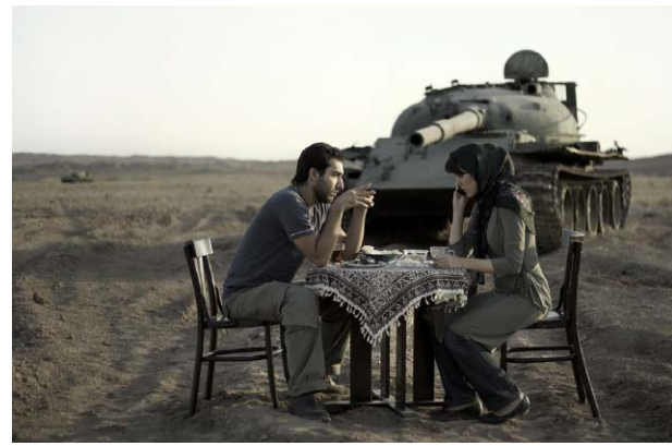
Gohar Dashti Today's Life and War 2008 Inkjet print 70 \times 105 cm

Frida Kahlo My Grandparents, My Parents, and I (Family Tree) 1936 Oil and tempera on zinc 30.7 \times 34.5 cm Collection: The Museum of Modern Art, New York Gift of Allan Roos, M.D., and B. Mathieu Roos. Acc. n.:277.1987.a-c.